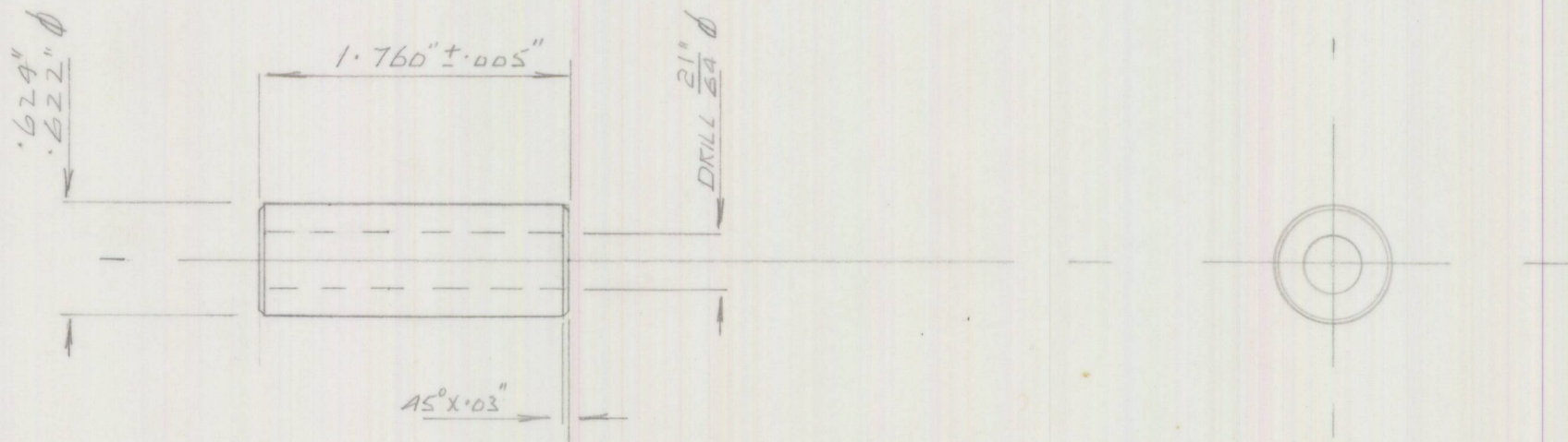
PIVOT BUSH. BRAKE PEDAL 1. OFF